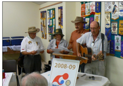
Our finely tuned artists' almost as old as the songs they sang.

They presented a most interesting travelogue of South Korea and Gwanju Province. It is certainly a most beautiful and interesting part of the world. What intrigued us all were the many festivals and cultural events which take place during the year and the marrying of the traditional past and the modern technological world. At the end of the program we were treated to a traditional Korean song and responded with our own bush balladeers.