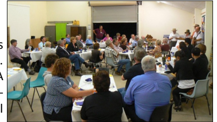
The crowd enjoy some good old fashioned bush ballads from our finely tuned artists

At the pavilion after learning to throw boomerangs, they were keen to share some Aussie Roast, the stuff you give up a date with Tom Cruise for. In return we shared some raw kingfish and sushi.